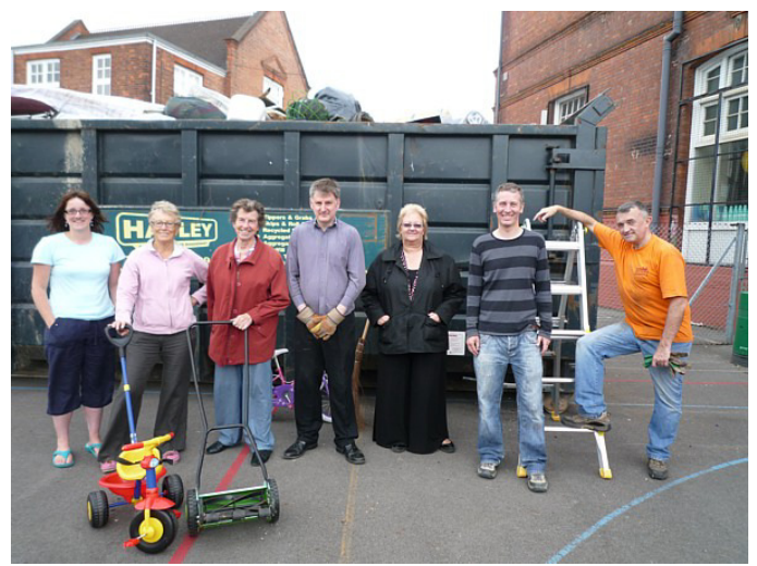
CLEANING UP AGAIN: some satisfied customers bring their rubbish, and (right) the Bell Tower tidy-up team with a full skip and some recycled goods