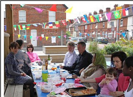
EATING TOGETHER: Neighbours relax and share their food

On Sunday 18 July we got together with neighbours for lunch in the school playground. Local people enjoyed some lively conversation and the chance to share food from different cultures.