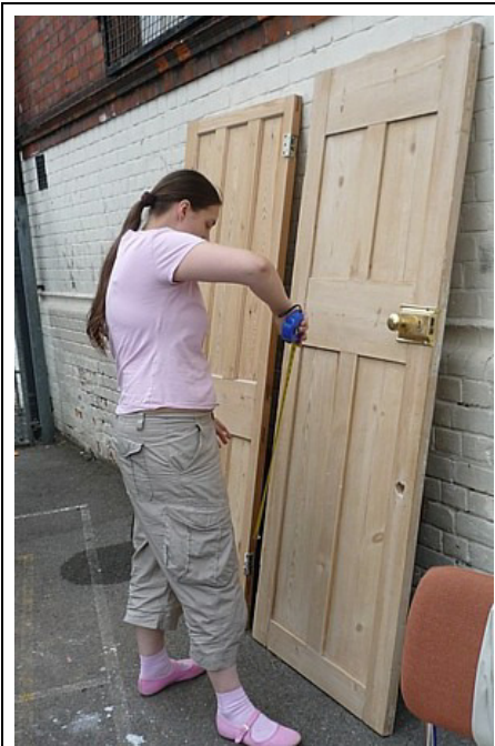
MEASURING UP: Old doors find a new home

The event, kindly sponsored by Reading Festival organisers Festival Republic, gave neighbours the chance to clear out their houses, gardens and sheds. Old furniture, mattresses and many other items were brought to the skip.