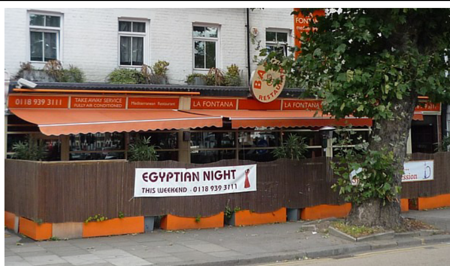
LIVELY VENUE: La Fontana restaurant in Caversham Road

La Fontana has recently come under new management and offers a wide range of food from around the Mediterranean and Near East. At weekends the restaurant really comes to life, with a variety of live entertainment from near and far. As