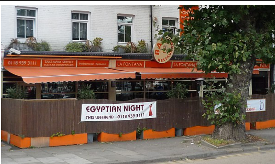
LIVELY VENUE: La Fontana restaurant in Caversham Road

La Fontana has recently come under new management and offers a wide range of food from around the Mediterranean and Near East. At weekends the restaurant really comes to life, with a variety of live entertainment from near and far. As