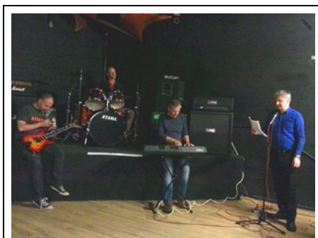
COME TOGETHER: at last there's a use for your rotten tomatoes!

Our first 'no fear jam session' took place at the Readipop studios on Sunday 15 May, the first event in our 'Let's Play' project. We hope (provided we don't have too many contractual or artistic differences in the meantime, of course) to have a band ready to perform a few songs at the street party.