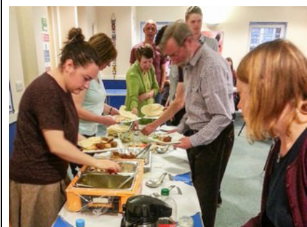
TAXING TIMES: one of the quiz teams in action and (below) some welcome half-time sustenance