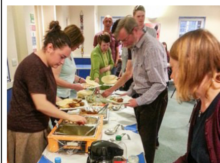
TAXING TIMES: one of the quiz teams in action and (below) some welcome half-time sustenance