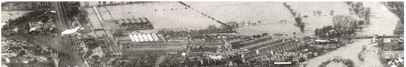
SURROUNDED: an aerial view of our area in March 1947, looking west. Caversham Bridge is to the right of the photo, with the railway on the left.

To view the Environment Agency's flood map and see more detail, go to www.environment-agency.gov.uk . The National Flood Forum's web site is at www.floodforum.org.uk .