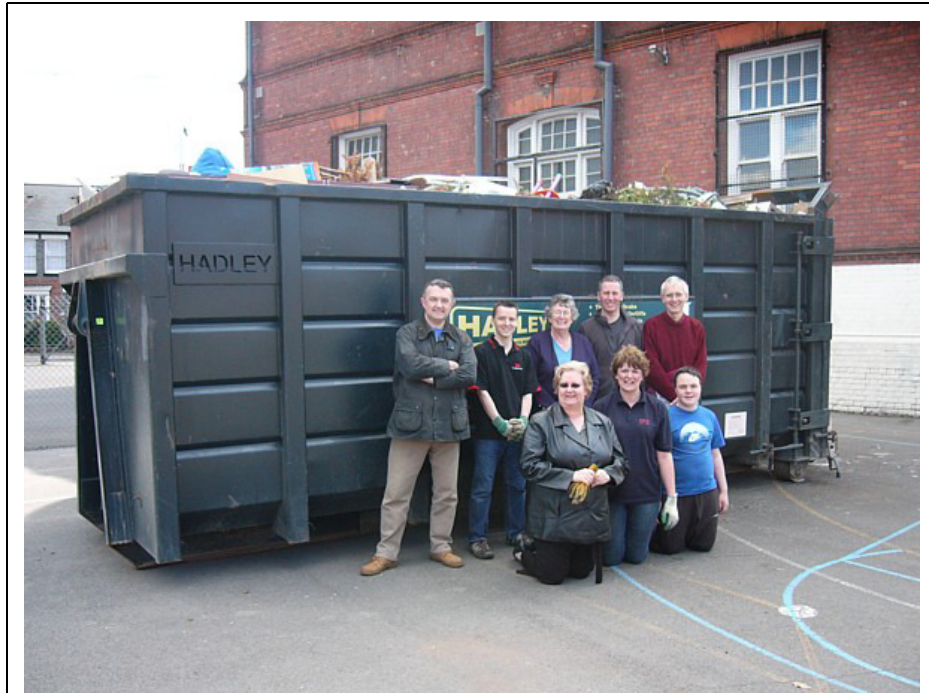
CLEANING UP: Association members with yet another full skip

Items left by local residents included furniture, mattresses and broken garden machinery - and among the more unusual items were a life-sized statue of a heron and a giant rubber duck. A recycling service was provided for unwanted items in good condition, and new homes were found for several bikes and