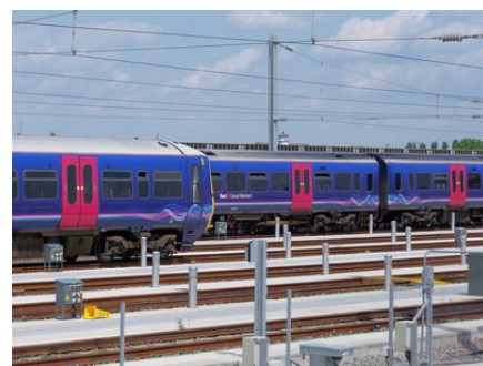
RIGHT BEHIND US: sidings at the new train depot

Some Cardiff Road residents continue to be affected by noise, vibration and pollution from trains idling in the new sidings on the embankment. At least one has been forced to sell her home as a result.