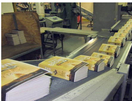
PRESSES ROLLING: the Bell Tower tour of the Cox & Wyman works in 2011, when it was printing two Dan Brown books per second

However, with the recent loss of a major printing contract its French-based owner CPI Books has announced the closure of the plant and redundancy for its remaining 41 workers. CPI owns several other sites in the UK including Mackays of Chatham and Bookmarque in Croydon, and plans to concentrate its investment elsewhere.