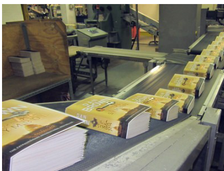
PRESSES ROLLING: the Bell Tower tour of the Cox & Wyman works in 2011, when it was printing two Dan Brown books per second

However, with the recent loss of a major printing contract its French-based owner CPI Books has announced the closure of the plant and redundancy for its remaining 41 workers. CPI owns several other sites in the UK including Mackays of Chatham and Bookmarque in Croydon, and plans to concentrate its investment elsewhere.