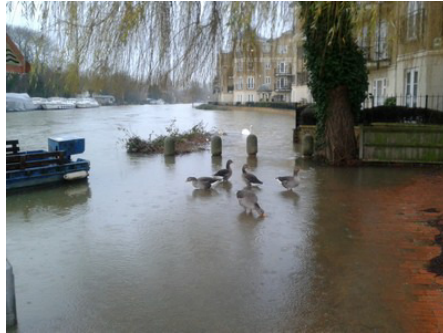
UNDER WATER: The current Environment Agency flood map with our area outlined in red, and the towpath at the end of Thames Avenue in January 2014.

The area around the Thames in Reading has escaped serious flooding this winter, but the news has been full of stories of flooded communities around the country. Reading has not escaped entirely - the army has been called out to repair river banks in Southcote, and several houses have been flooded there.