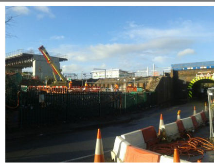
BIG PROJECT: The new viaduct will dwarf Cow Lane bridges

Readers may have noticed that there is a huge civil engineering project going on nearby. The old train depot between the Cow Lane bridges has now been demolished, and the new viaduct is under construction. This will go over the top of the existing tracks and will carry the main lines to Oxford, Swindon and beyond.